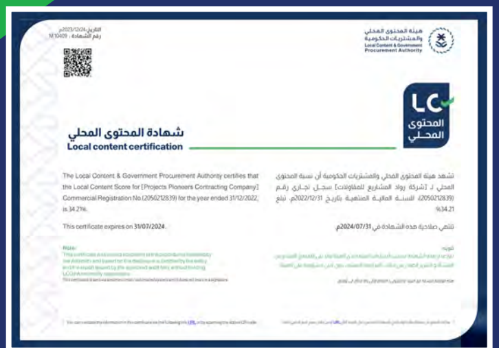
Local Content Certification